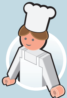
LUNCH AT DAY CARE CENTRES, SCHOOLS AND AFTER-SCHOOL CARE CENTRES

All that is left now is to take part! Ask about what's on offer locally. Have a word with clubs and associations in your area which are not yet part of the educational package. Submit your applications as early as possible and always keep receipts, invoices and registration forms. Here is what is included in the educational package: