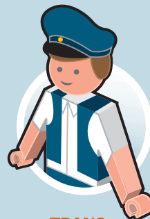
TRANSPORTATION TO/ FROM SCHOOL