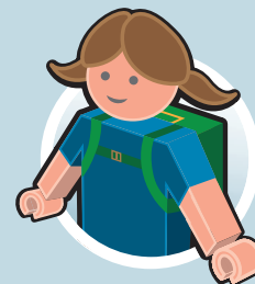
DAY CARE CENTRE AND SCHOOL TRIPS