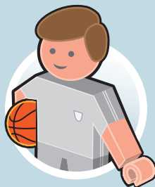
CULTURAL, SPORTS AND LEISURE ACTIVITIES